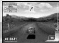
Behind Car (Far)

The HeadCam view allows you to rally from the perspective of a real rally driver. The forces that operate on a real driver are simulated as you rally around the stage. HeadCam may not be available depending on which setting you have selected for Car resolution in the Graphics Options.